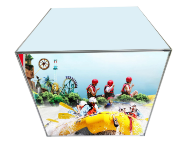
4. Put on the graphic