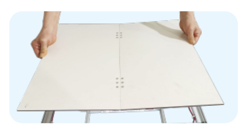
3.Put on the counter top