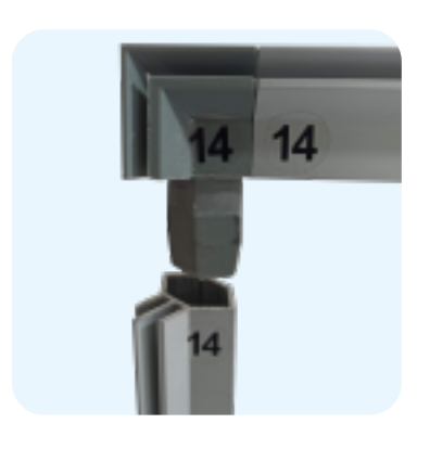
1. Assemble The Profiles (follow numbers)